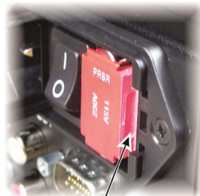
NOT FULLY SEATED