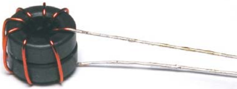
T2 Wound On Two Gray FT-37-43 Cores